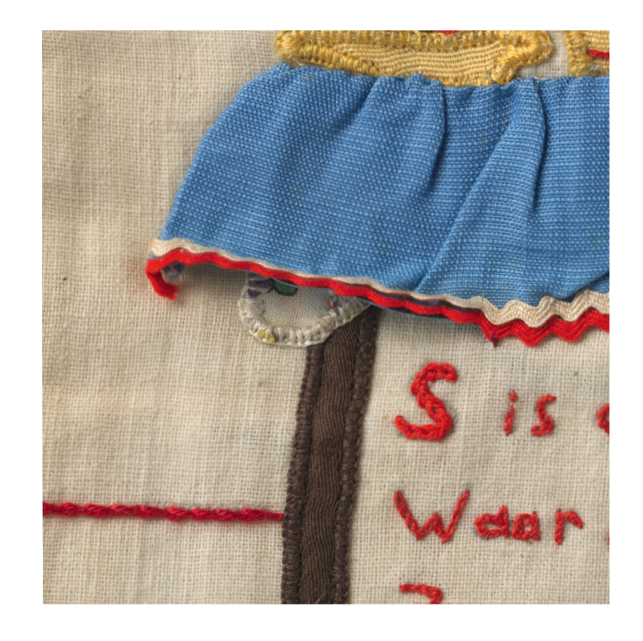
Fig. 10 Detail of the table cloth that was changed in the letter S.

identified; it could well be make-up (rouge, lipstick) or wax crayon. Accumulating these materials must have been an undertaking in itself. It is likely that the women got together to look for materials that could be used.