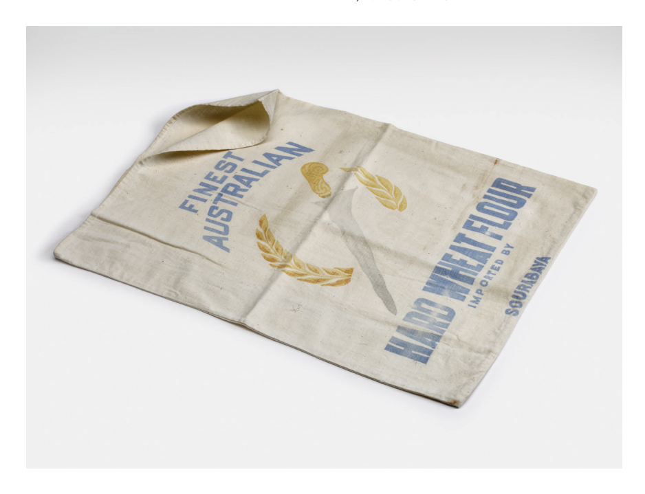
Fig. 6 Sack in which flour was delivered to the Japanese Brastagi camp. Fabric, 44 x 56 cm. The Hague, MuseonOmniversum, inv. no. 208976.

institutions.10 The Museon-Omniversum in The Hague houses a collection of fabrics from the Japanese camps, including at least ten items from Camp Brastagi: embroidered covers for little books and memorabilia like a shawl with the names of female friends on it. The many references to food, in the embroidery as well as in the recipe books scribbled in pencil, in which the most extensive recipes are spelled out, are sardonic. This form of dealing with hunger in the camps is called reciptitis. A number of objects and items made from fabrics from the Japanese camps can also be found in the NIOD Institute for War, Holocaust and Genocide Studies and the Verzetsmuseum (Dutch Resistance Museum) in Amsterdam. In the Rijksmuseum's collection, there is a school history notebook from Camp Brastagi made by Harmien Voorhoeve, containing short sentences in English and years pertaining to relevant historical moments; also in the collection are some board games (Reversi, Trik Trak and Draughts) created in the camp by I. Bernelot-Moens.<sup>™</sup>