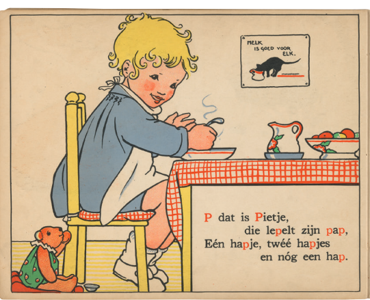
Fig. 13 Spread with the letters P and Q in Cramer's A is een Aapje (fig. 2).