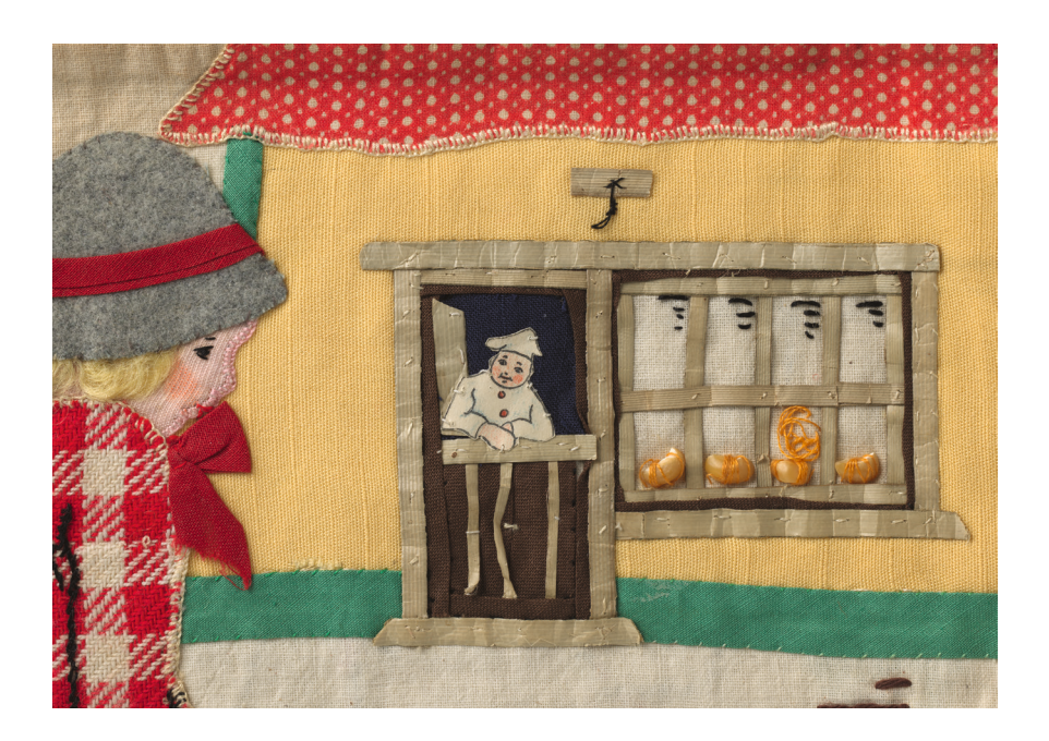
Fig. 8 Detail of various materials in the letter B.

the letter Q) and she kept it and owned it until she died. Cramer's pictures were copied in pencil on to pieces of unbleached cotton from old rice or flour sacks cut to size (fig. 6). The underdrawing can be seen with the naked eye on most of the pages (fig. 7).