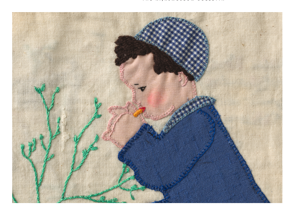
Fig. 9 Detail of the buttonhole stitch in the letter F.

The images are taken straight from Cramer's book, but the pages in Pemmy's Alphabet Book are quite a lot bigger, very colourful and lively, and made with a wide variety of materials. The research into the materials used confirms that it was treated as a serious project.<sup>14</sup> There are scraps of plain fabrics in different colours (red, yellow, pink, blue, green, white and black) as well as printed materials with dots, checks or other designs. The makers used felt in different colours, ribbon, bias binding, narrow strips of lace, artificial fur or fabric from cuddly toys, as well as natural materials such as straw and maize kernels (fig. 8). The variation is enormous, even in the threads that secure the fabrics, mainly cotton thread but sometimes wool as well. We see some materials return on different pages, such as little pieces of shiny black and red oilcloth, plain cotton, felt, splinters of bamboo and sticks. Yellow hair from a wig or doll was used for a wavy hairdo for a number of the heads of children. A blush was applied to the cheeks of the little figures with a substance yet to be