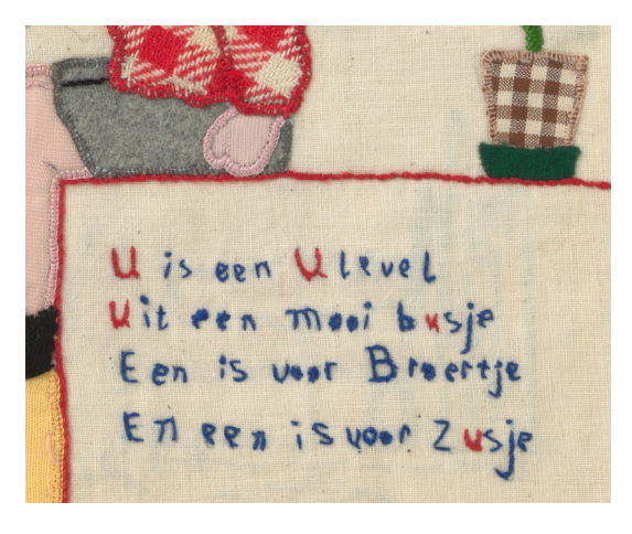
Figs. 11a, b, c, d Details of verses in different handwritings, with different stitches.

Although the materials are very diverse, the style is extremely consistent. In each little scene, moreover, we recognize the same clear buttonhole stitch in the outlines of faces, hands, arms and legs, and the stitching in the embroidered parts of the images is very uniform (fig. 9). Although this does not chime with the oral tradition which has it that there were multiple makers of the images, the technical research suggests that this had been the work of one person, Mies Aalbersberg. As we have seen, she sometimes mentioned that she improved things after being given work by other women because she was not always satisfied with their sewing skills.15 It is not evident from the research that she may have improved their work and reworked some of the parts. Although it is not