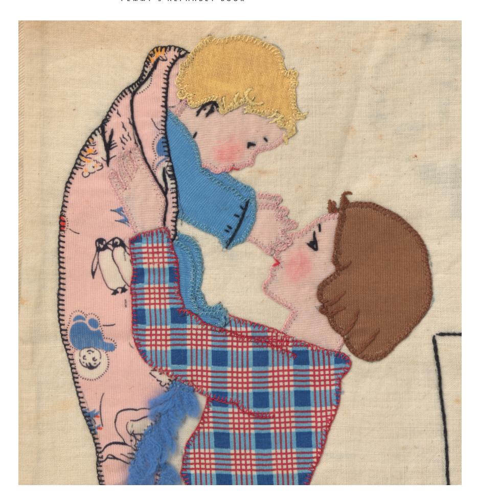
Fig. 15 Detail of mother and child in the letter Z.

also the joy that can be achieved in spite of everything: a last straw and the connection with a normal life. Even the materiality of the object plays a role in this, because it concerns recognizable objects from everyone's daily life.